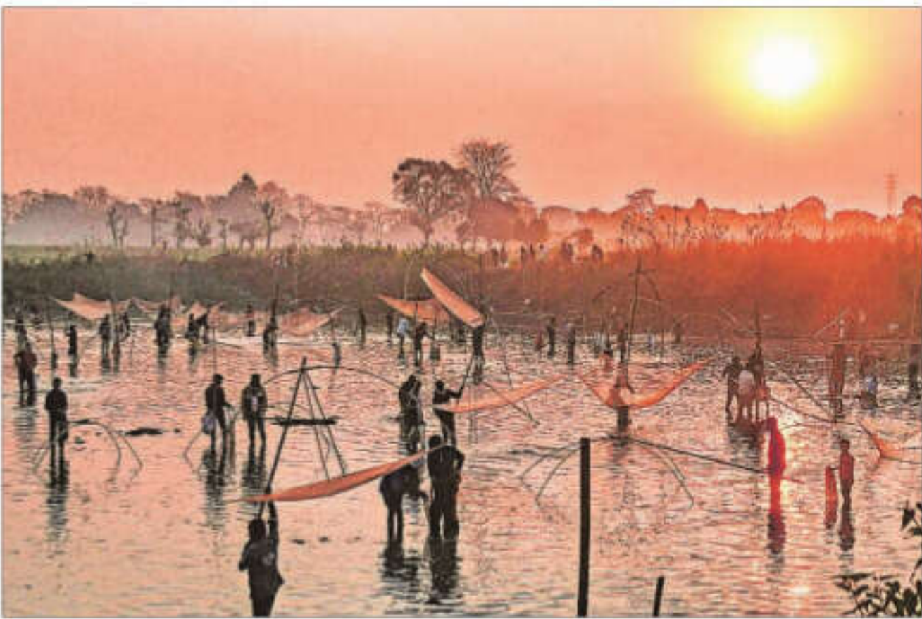
People engage in community fishing ahead of Magh Bihu in Tezpur district, Assam, on Tuesday. Traditionally, community fishing has been a part of the harvest festival