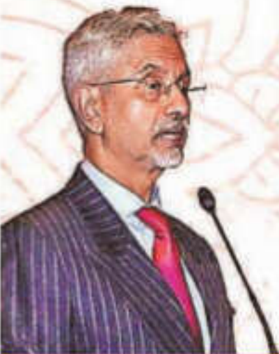
S JAISHANKAR, EXTERNAL AFFAIRS MINISTER

BRICS remains an important forum that encourages dialogue and cooperation and practical responses