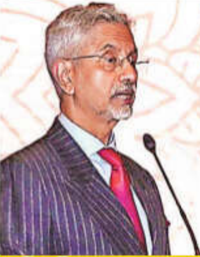
S JAISHANKAR, EXTERNAL AFFAIRS MINISTER

BRICS remains an important forum that encourages dialogue and cooperation and practical responses