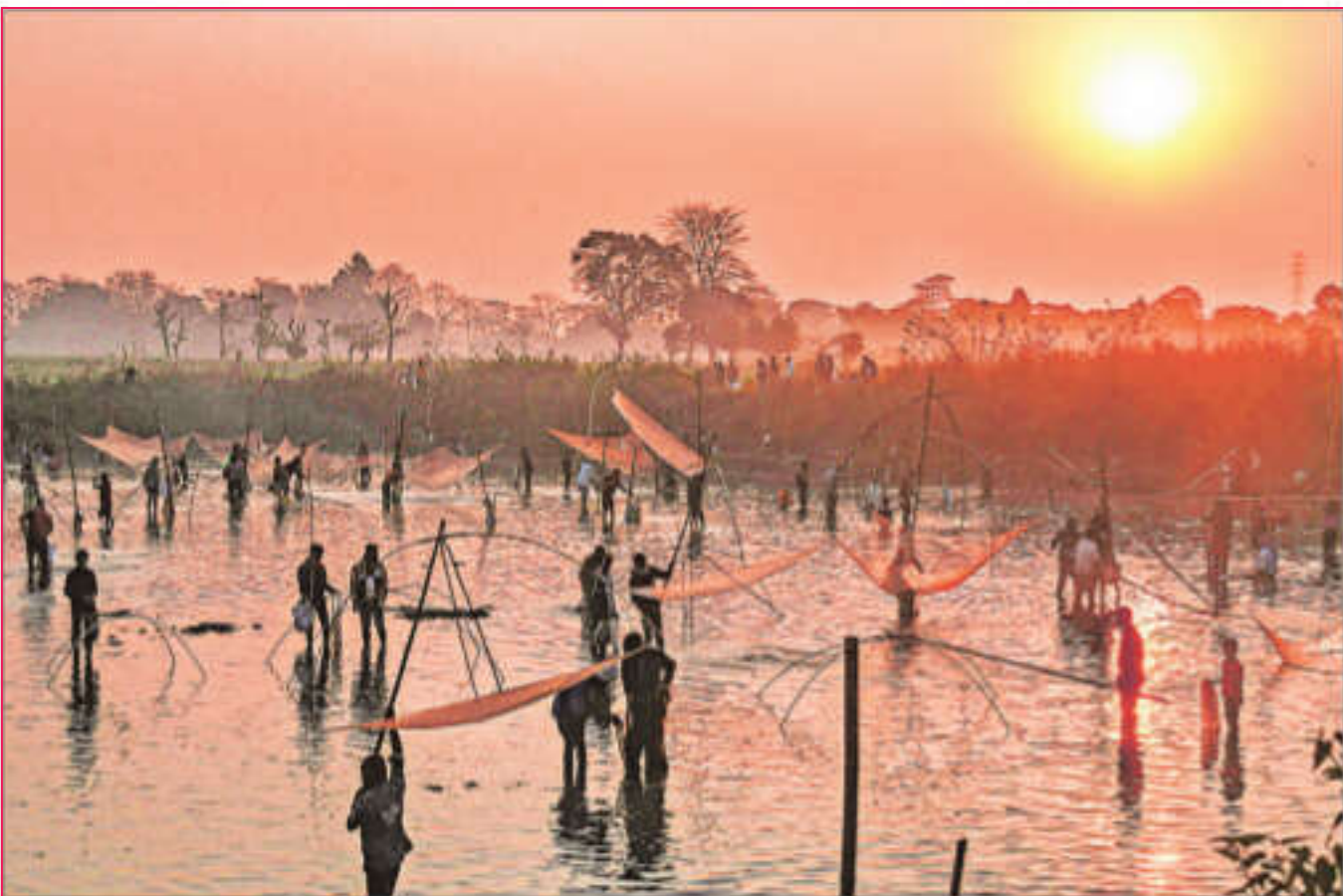
People engage in community fishing ahead of Magh Bihu in Tezpur district, Assam, on Tuesday. Traditionally, community fishing has been a part of the harvest festival