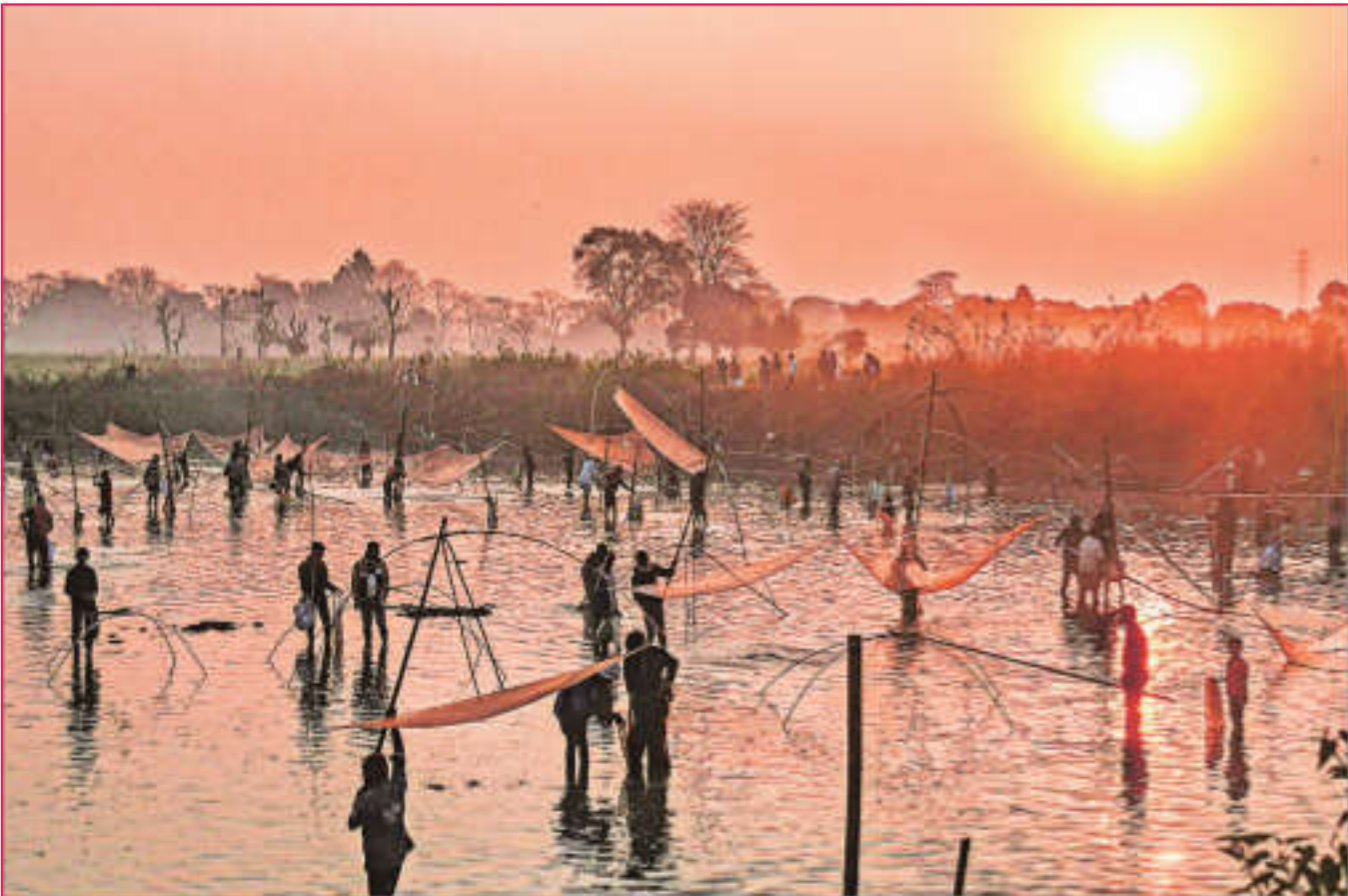
People engage in community fishing ahead of Magh Bihu in Tezpur district, Assam, on Tuesday. Traditionally, community fishing has been a part of the harvest festival