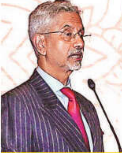
S JAISHANKAR, EXTERNAL AFFAIRS MINISTER

BRICS remains an important forum that encourages dialogue and cooperation and practical responses