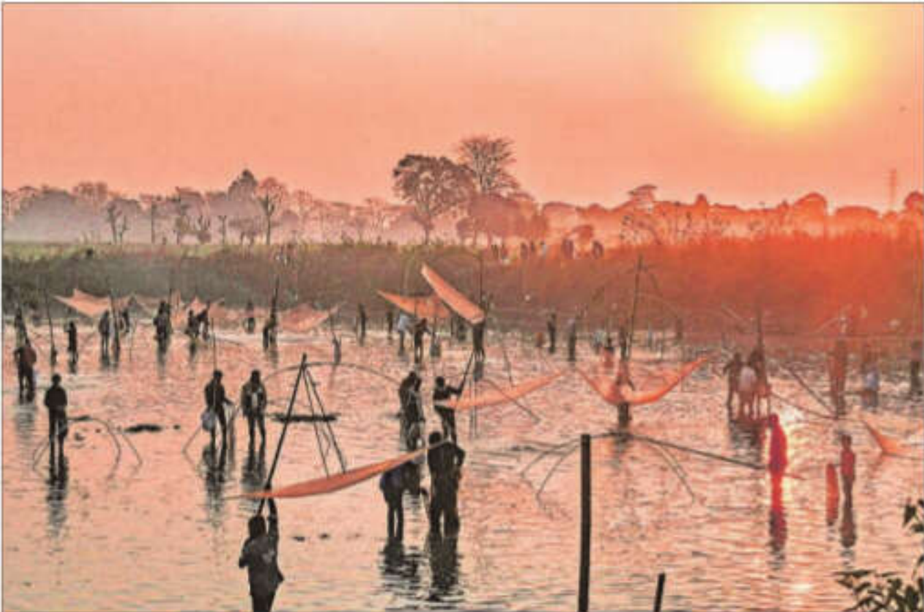
People engage in community fishing ahead of Magh Bihu in Tezpur district, Assam, on Tuesday. Traditionally, community fishing has been a part of the harvest festival