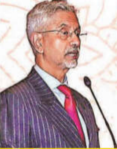
S JAISHANKAR, EXTERNAL AFFAIRS MINISTER

BRICS remains an important forum that encourages dialogue and cooperation and practical responses