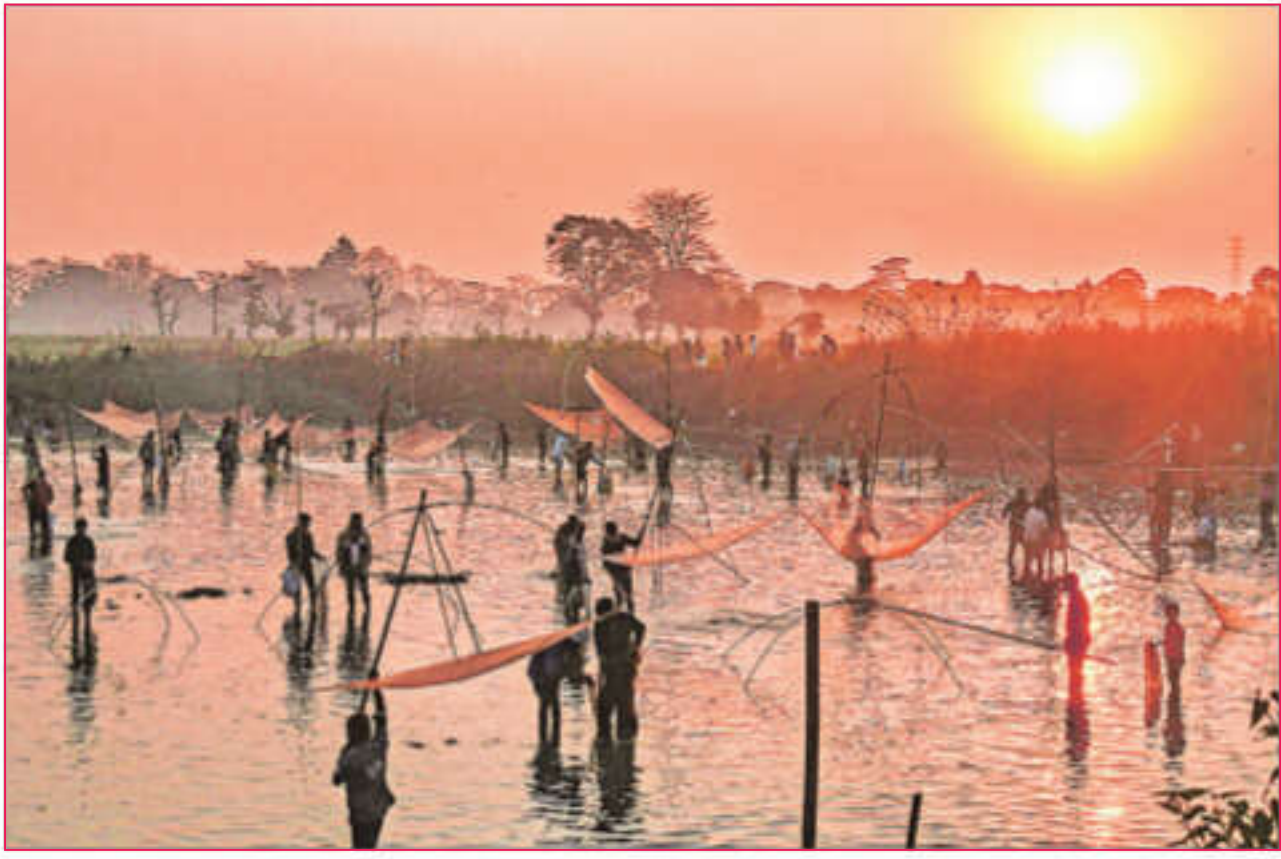
People engage in community fishing ahead of Magh Bihu in Tezpur district, Assam, on Tuesday. Traditionally, community fishing has been a part of the harvest festival