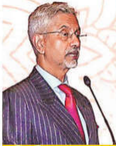
S JAISHANKAR, EXTERNAL AFFAIRS MINISTER

BRICS remains an important forum that encourages dialogue and cooperation and practical responses